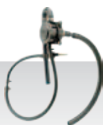
Open Crankcase Ventilation